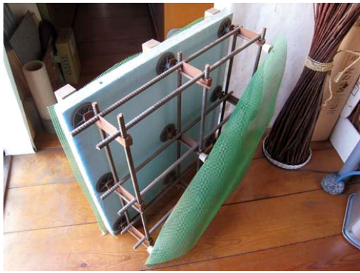
Kenzo Unno's 'zero-waste' formwork

Unno's 'zero-waste' formwork uses a reinforcement cage to support the fabric, so bracing and propping elements are not required. For insulated construction, the fabric, together with rigid polystyrene insulation boards, forms the shuttering. Furring strips – long, thin strips of wood or metal – are used as support, and remain in place after the concrete is formed to provide fixing points for cladding. After use, the fabric, a woven polypropylene geotextile, can be washed and used again.