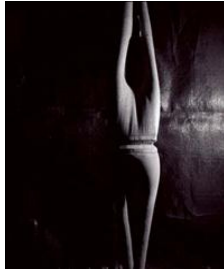
Concrete column by students at Edinburgh University made using flexible formwork

Interest in the technology is growing – a conference organised by the International Society of Fabric Formers was held in Manitoba, Canada, in May. Fabric formwork technology is actually very old – rammed earth within hessian sheets was first used 2,000 years ago. But a new generation of designers is reinventing it as a sustainable construction method for the 21st century – the work of three of them is introduced here.