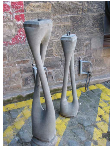
Remo Pedreschi has researched how a new architectural 'language' of sensual fluid forms could emerge from flexible formwork

The wide variety of column-section shapes produced in Remo Pedreschi's workshop at Edinburgh University, where he is a professor, is the result of manipulating the hydrostatic pressure of wet concrete. The formwork, which consists of stretched and twisted fabric tubes, produces figure-of-eight-shaped forms, hollow columns and columns with voids. To connect the various elements, Pedreschi developed interlocking male and female components. A vacuum-formed mould was incorporated into the ends of the formwork to ensure geometric accuracy. Independent of the columns, the prototype connection can be used in other components.