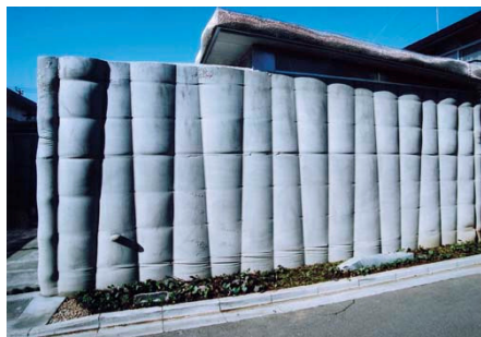
Stone Renaissance House, Funabashi City, Japan, by Kenzo Unno of Umi Architectural Atelier

For Tokyo-based firm Umi Architectural Atelier's Stone Renaissance House, concrete formwork was created using the 'frame restraint' method, developed by the practice's Kenzo Unno. Netting is stretched along the inside of steel pipes, restrained by standard form ties running through holes drilled in the pipes. Concrete is poured in and, when the walls set, the restraining pipes are removed, leaving a vertical impression. For this project Unno experimented with a diagonal pattern.